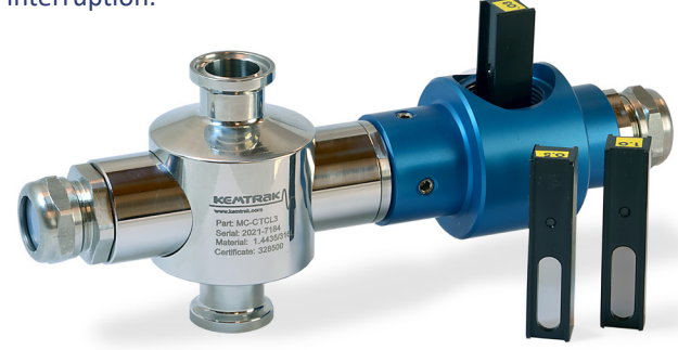
Integrated NIST validation accessory

Standard features include multiple product switching, remote zeroing and signal filtering. A built-in graphical internet based interface allows remote operation, calibration, validation and data trending using a standard web browser.